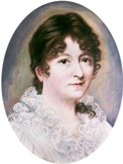
The young Mary Aikenhead

Mary Aikenhead (1787-1858), who founded the Religious Sisters of Charity in 1815 to provide services to "the suffering poor", was declared Venerable by Pope Francis on 18 March 2015.